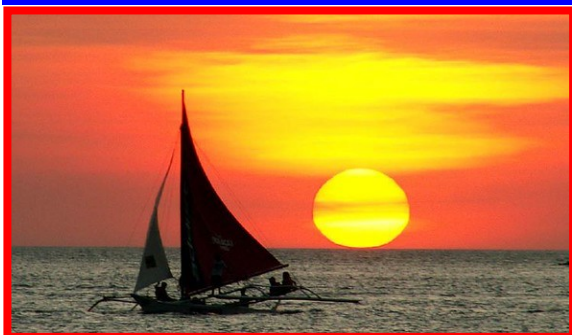
Ready to set Sail !