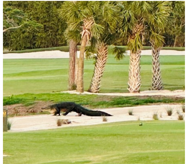
Looks like this gator is heading to the next tee. Beware!